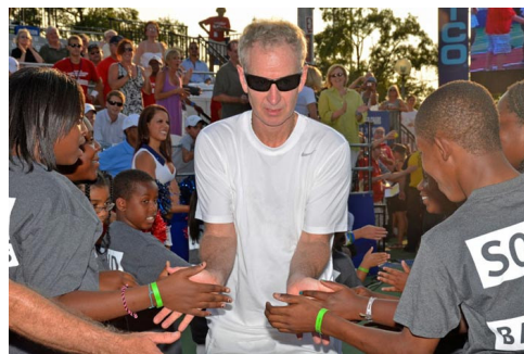
Marquee player John McEnroe played for the Kastles on July 12 in the team's match against the New York Sportimes.