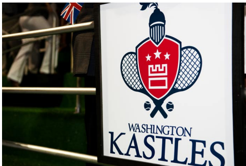
Kastle Systems security company is the namesake sponsor for the team.