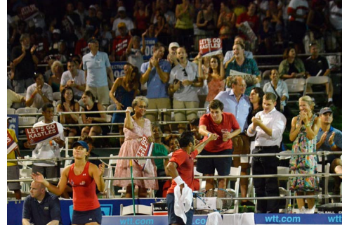
The stadium was nearly sold out each night during the three-week tennis season.