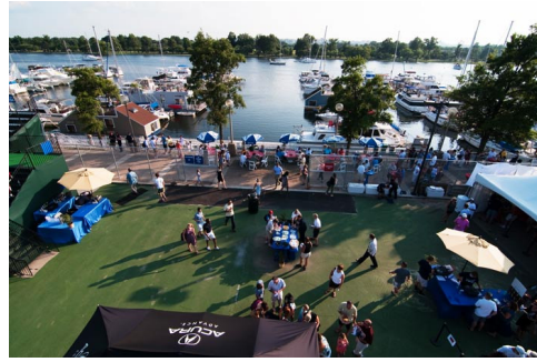
Previously in the middle of the city, the new stadium is on the southwest waterfront, complete with direct boat access.