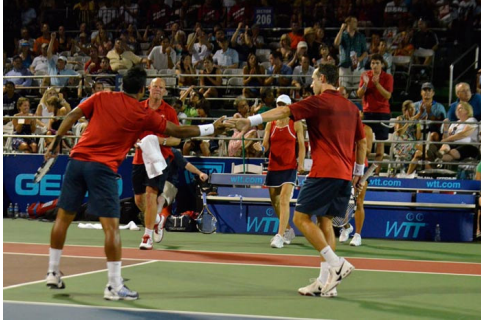
The Kastles wrapped up their season undefeated on Sunday.