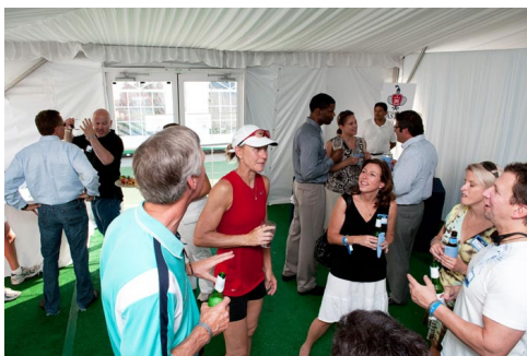
Kastles players mingled with guests in the sponsor tent before and after matches.