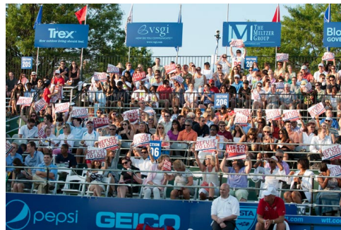
Team sponsor signs lined the top and bottom of the stands.